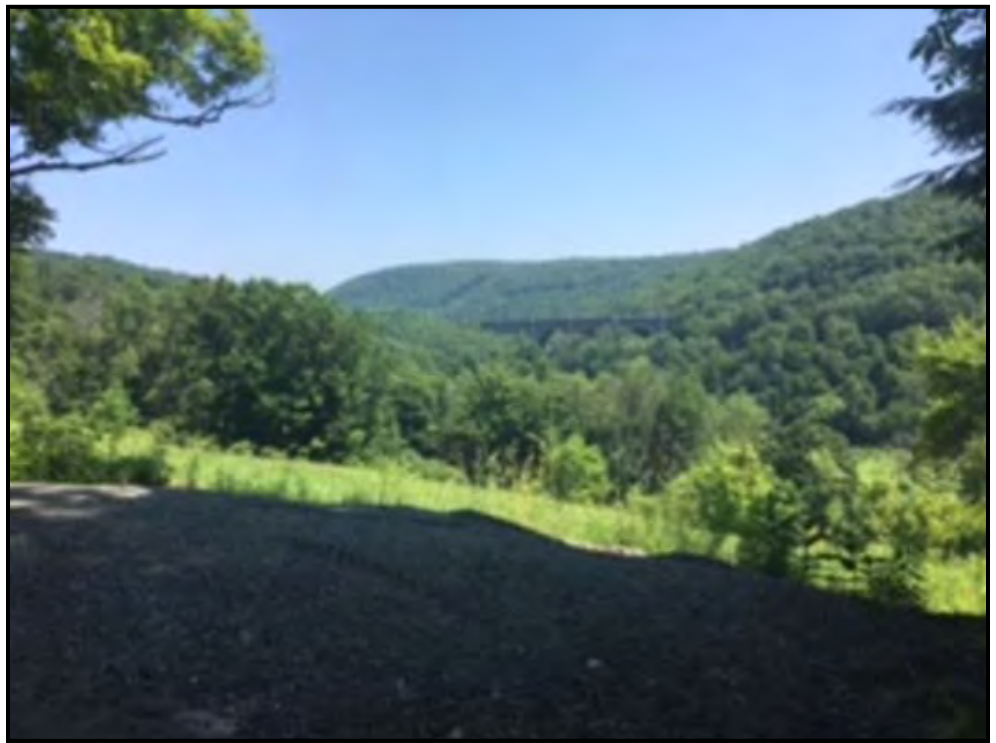
Martins Creek → Viaduct scenic overlook site under development.

A progress report of the effort to place a scenic overlook information site on Zick Hill, for viewing the Martins Creek Viaduct; as well as the effort to obtain an official state historical marker for the same viaduct will be provided at this meeting as well