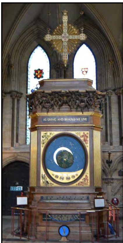
Memorial to WWII Allied Airmen Minster Cathedral, York, England