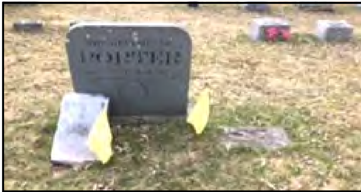
Burial site of Rev Charlotte Porter, First Universalist Church - first ordained female minister in Northeast Pennsylvania, Mt View Cemetery (Old Universalist Cemetery)

Other items on the agenda for this meeting include a status of the Old West Side Cemetery, grant applications to the Endless Mountains Visitors Bureau for our new museum and renewing our website domain name.