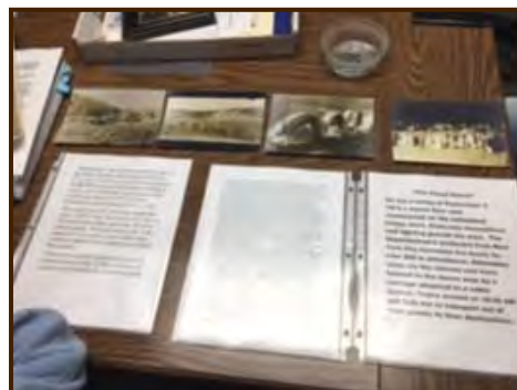
← Data Collection effort for scenic overlook site for the Martins Creek Viaduct