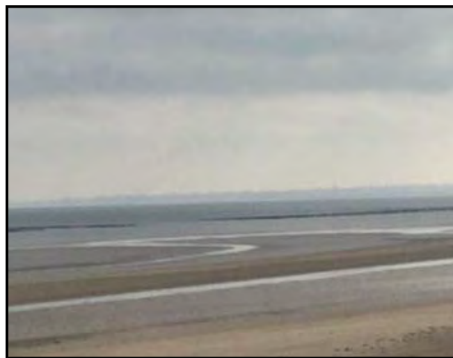
Utah Beach, Normandy France October 2017

Beach at Normandy. Our home there for three days was the historic Ivy House B+B. On the morning of the D-Day invasion in 1944, this French farmstead was commandeered as headquarters building for the region's German Army Commander.